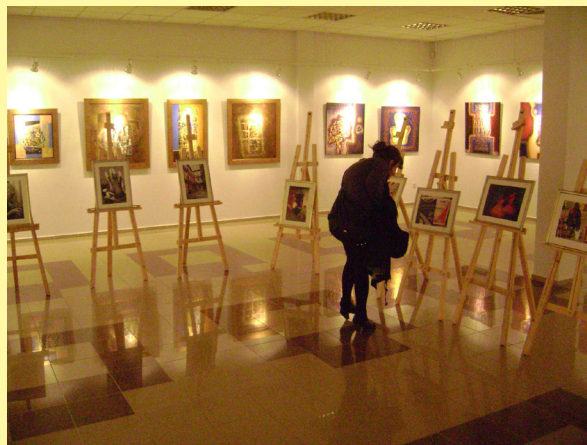
● Exposition in Izmir. Down, police radio with the new volunteers.