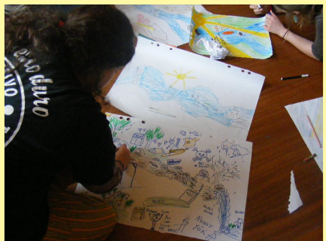
● Drawing what the experience means for you...

● You can see more here: http://www.systemandgeneration.eu/