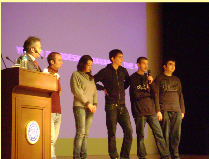
● EVS Presentation in Izmir.