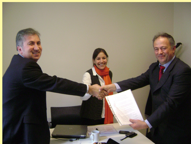
● Shaking hands with Anna Lindh Foundation.