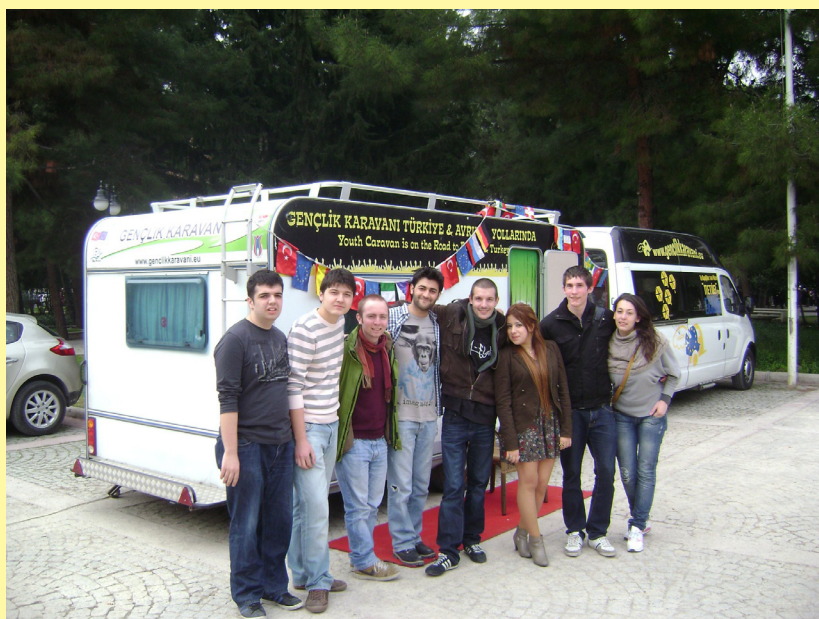
● Youth Caravan in Izmir. Right, meeting with EVS volunteers in the same city.