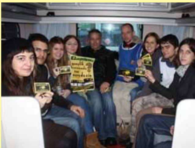
● YouthCaravan in Aydin.