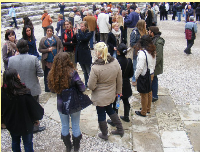
● Volunteers listening to the guide in Aspendos.