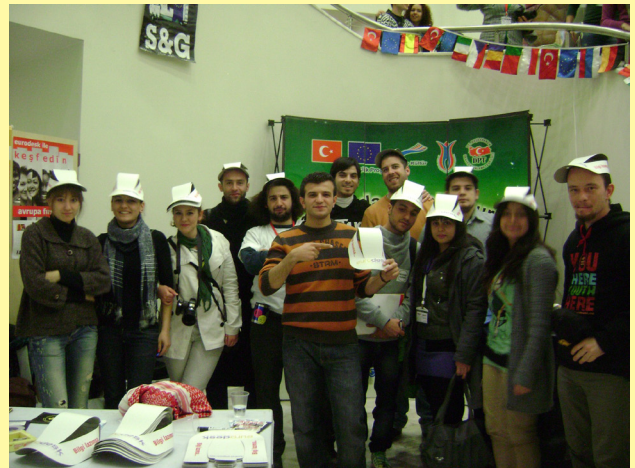
● NGO's fair in Ankara.