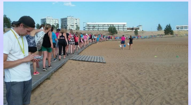
Juku Camp, Kalajoki

“...I had fun and danced with the children and my friends also damat halayı :D We sang a song every day and I was going to beach every night after the children sleep.