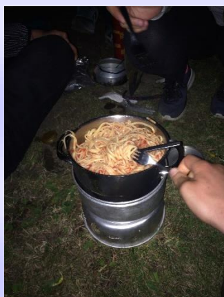
We cooked a pasta on the street.

Also, we had holiday that was for 4 days. Put the holiday in second week of the project was logical because the holiday may make us closer. The plan was hitchhiking as far as Turku and Helsinki and then to go to Tallinn. Also, we did it in 4 days I had amazing memories. First day, we divided into two groups as hitchhikers group A and B and we met Vaasa at night. We were so hungry that we cooked pasta on the street! While we were eating pasta, the weather was so rainy because of that we set up our tent in the garage!