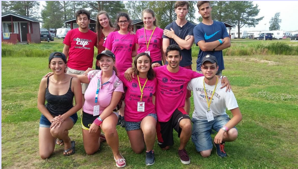
Youth can do it! EVS volunteers in Juku Camp

The next event was Juku Camp I really enjoyed after Kakkola Cup. I was with the children during the Juku Camp that was like a holiday for me. Every day, after the breakfast, we had action scenes. In the action scene, we were instructor for children. We were telling the games but generally, children didn't understand what we meant because they didn't speak English. That's why the leader of every hippo-group was translating what we said. Due to communication was difficult, I decided to dance with the children on the next days. I had fun and danced with the children and my friends, we also danced damat halayı :D We sang a song every day and I was going to beach every night after the children sleep.