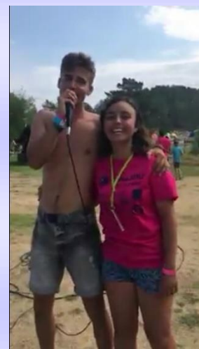
While we are singing a song to children