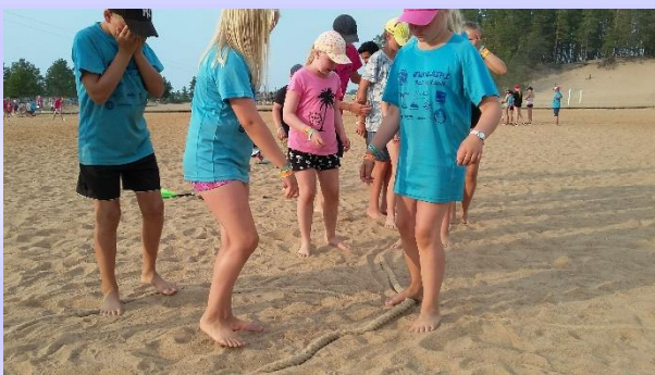
Juku Camp, Kalajoki