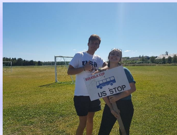
Preparation for Kokkola Cup

In first week, there was an arrival-training and I was trying to know other participants that are from Hungary, Spain, Luxembourg and Italy. Firstly, even if living with 10 people in a cottage, I didn't want to leave from here in the recent days. After first week, we worked for preparation on Kokkola Cup that we need to cut the grass, organize tables and chairs in the schools, carry some stuffs and so on. Sometimes, it was boring and difficult to carry some foods and drinks to the schools. I was fulfilling the duties as a volunteer day by day.