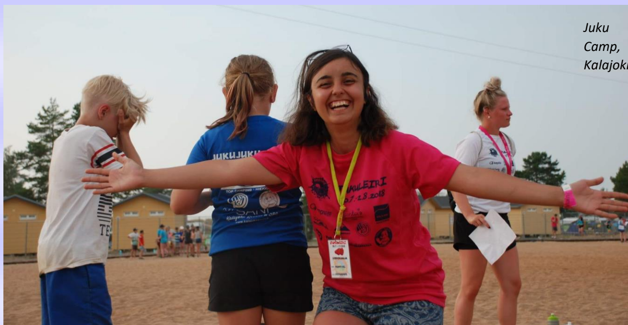
Juku Camp, Kalajoki

...It was just 6 weeks but it has made feel more than 6 week like a long term.